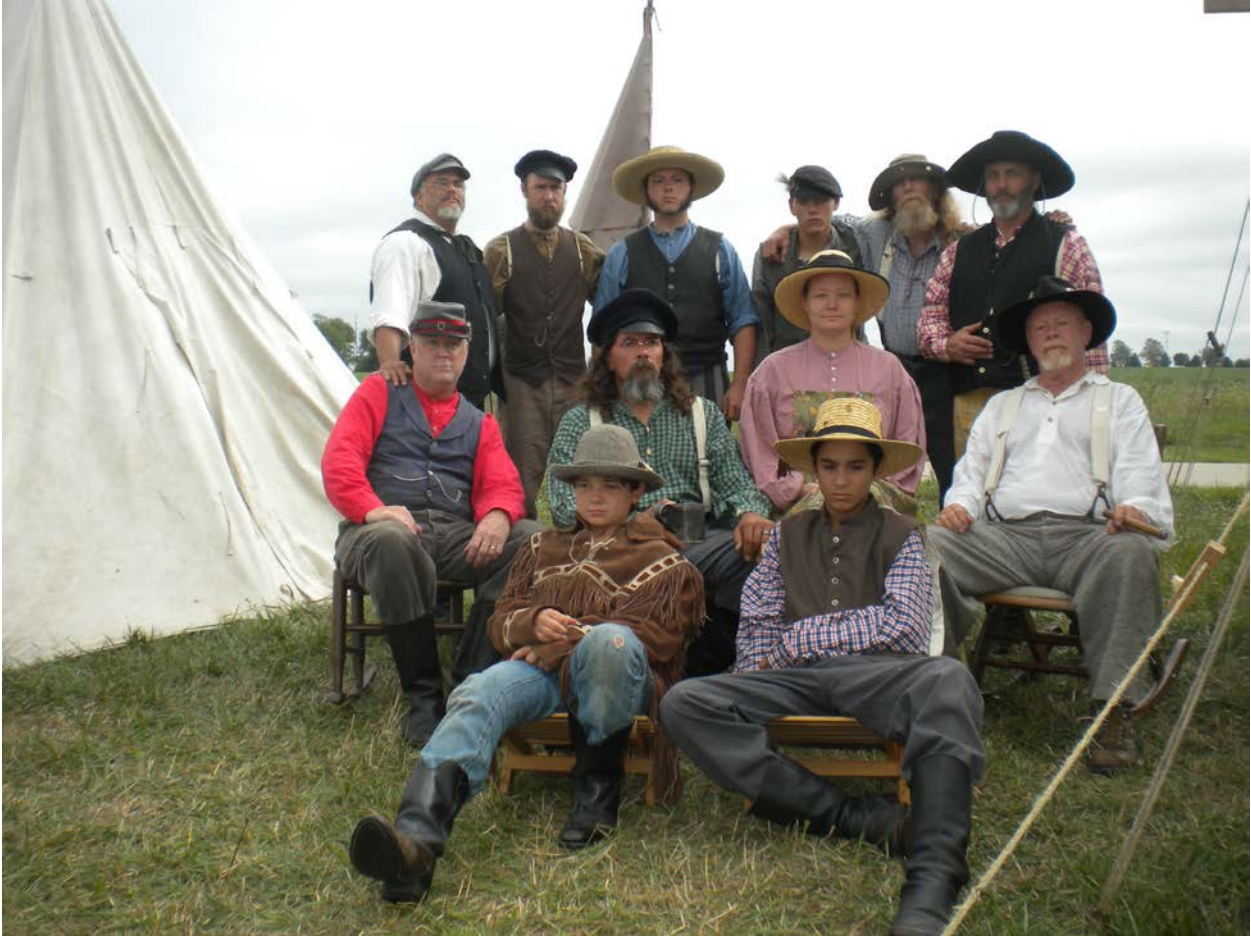
Members of the 3 rd Battery Missouri Light Artillery at the 2012 reenactment at Lamoni, Iowa.