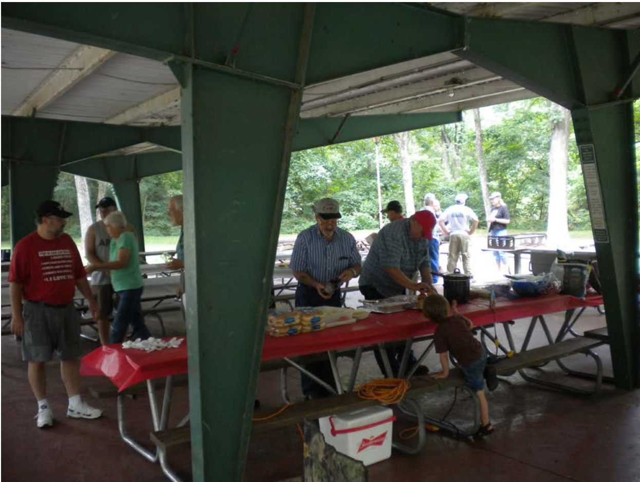
Chow time at the Family Picnic

Saturday August 3 rd the Key Camp held its annual family picnic at Shawnee Mission Park. The weather was excellent as was the food. Twenty-four members and friends attended the event and all agreed that it was a wonderful time.