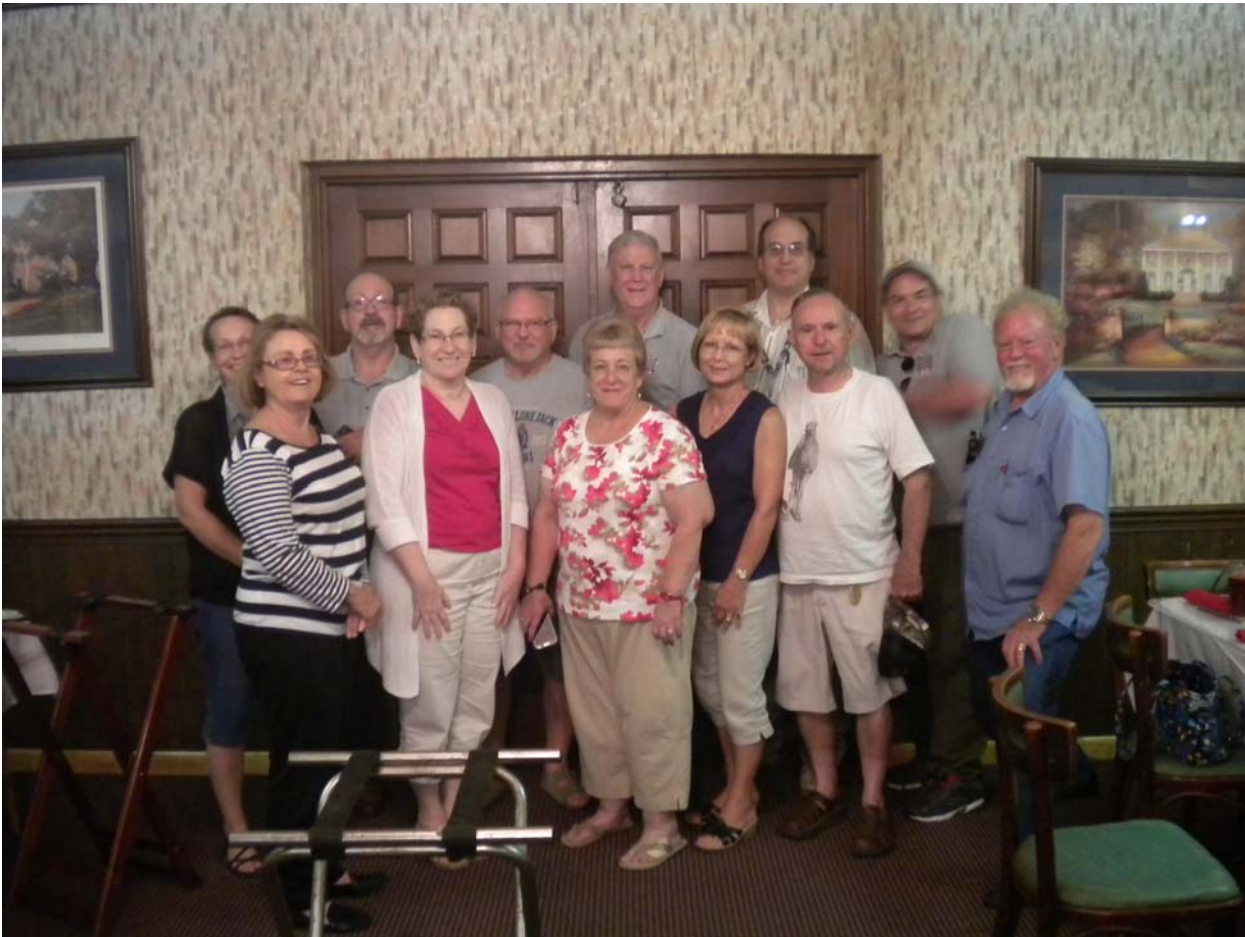
Key Camp at Vicksburg's Beechwood Restaurant

Vicksburg, Mississippi was the site of the 118 th National SCV Reunion held at the Vicksburg Convention Center. The convention was held from 18 through 20 July 2013. As usual, it was a great event and a tremendous amount of fun for those who attended. The Key Camp was well represented with eight compatriots and five of our ladies. Thursday evening the Key Camp group went to dinner at the Beechwood Restaurant and we had a wonderful time.