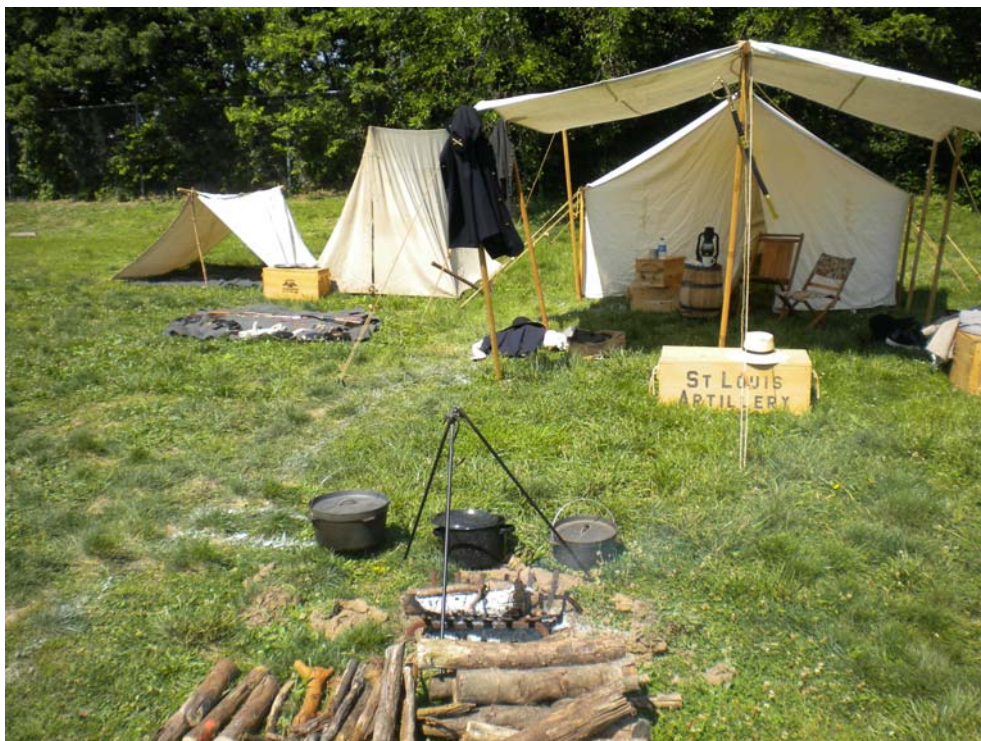
The camp set up for the living history presentations.